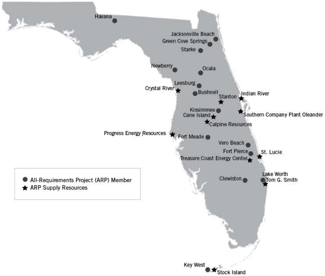
Figure ES-1 ARP Participants and FMPA Power Supply Resource Locations