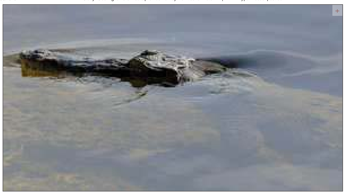
American crocodiles are seen near Florida Power & Light Co.'s Turkey Point Nuclear Power Plant near Homestead. (Joe Raedle / Getty ... Read More

SACE contracted with Bill Powers of Powers Engineering, San Diego, to look at technologies that FPL could implement to solve problems caused by the system that is polluting Biscayne Bay and seeping into the aquifer that provides drinking water to more than 3 million people.