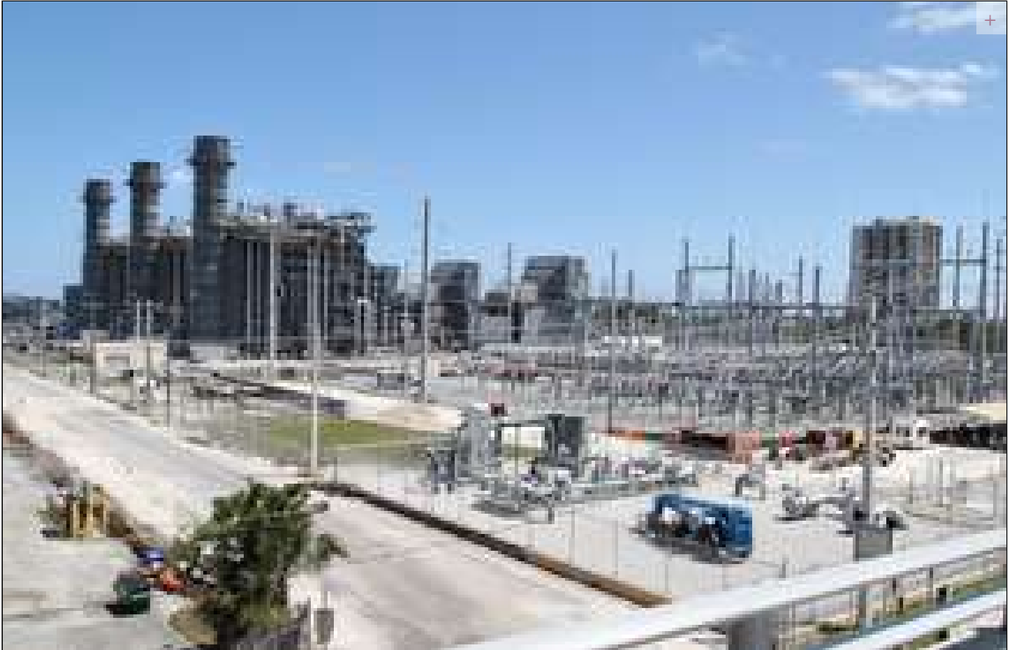
Florida Power & Light Co. seeks a $1.34 billion four-year increase in customer bills.

Intervenors have the right to ask FPL questions about its proposed rate increase, file briefs, make opening statements, call witnesses and cross-examine them. Hearings in the quasi-judicial proceedings are scheduled to be held in Tallahassee for two weeks starting Aug. 22.