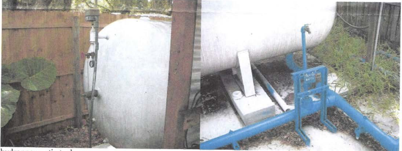
air compressor on tank