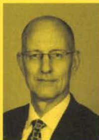
COMMISSIONER Donald J. Polmann