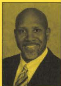
COMMISSIONER Art Graham