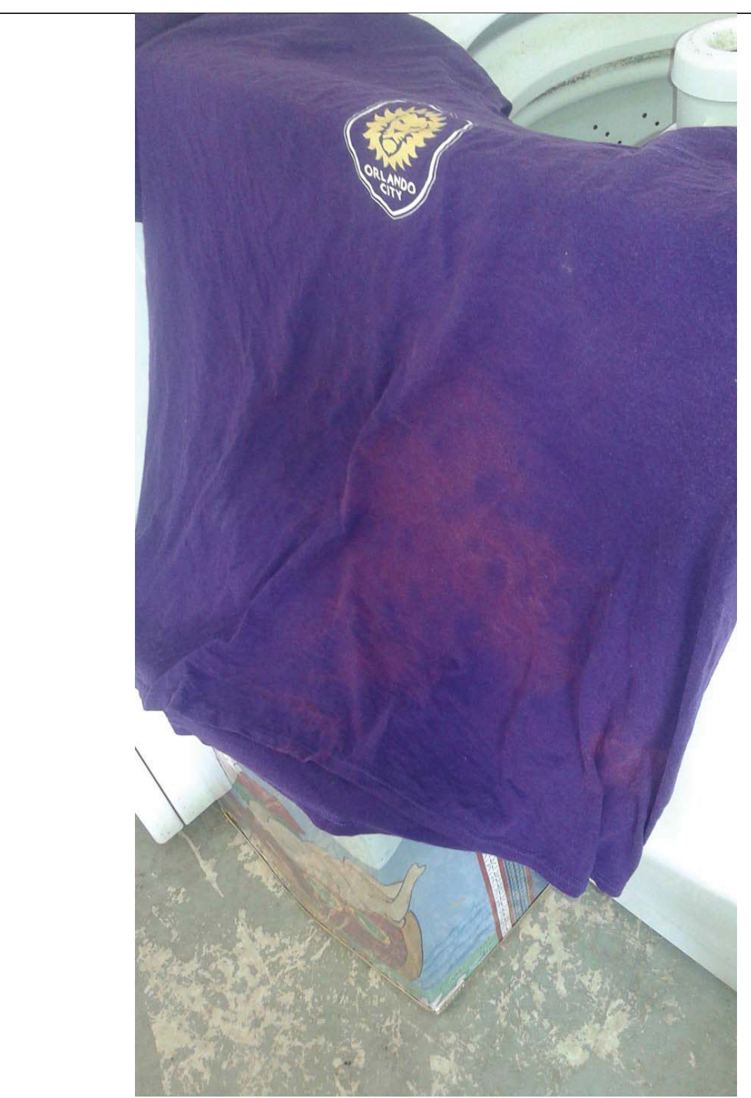
Photo 7 - Bleached clothing after FDEP approval of Chlorine Dioxide (CLO2) use in Pluris water.