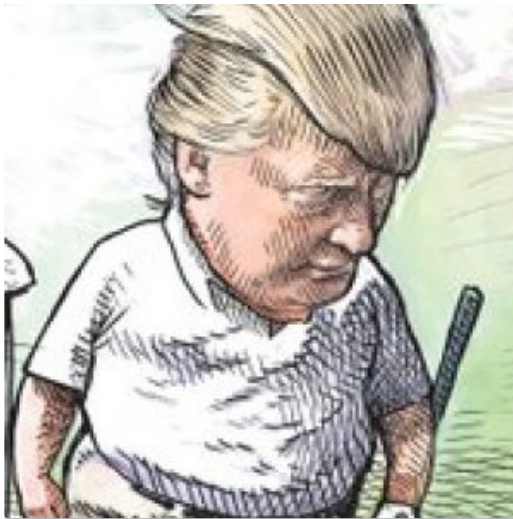
The Political Cartoon That Went Too Far