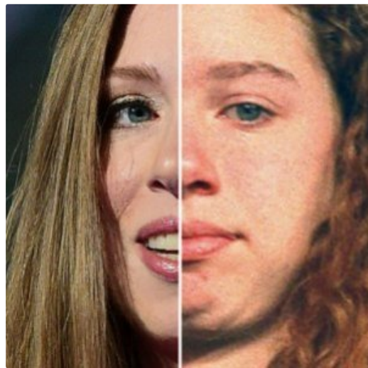
Chelsea Clinton's Transformation is Nothing Short of Stunning