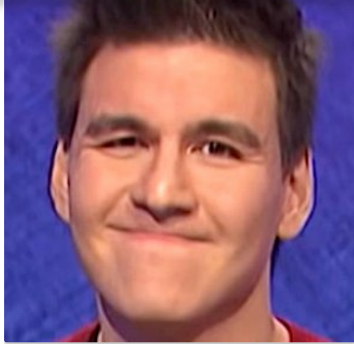
'Jeopardy!' Leak Is Under Investigation