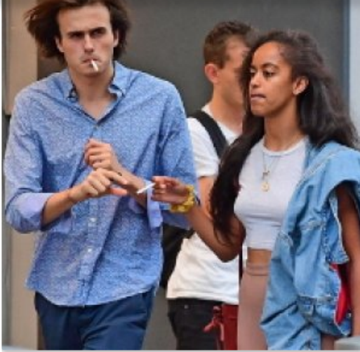
Malia Obama's Boyfriend Comes From an Insane Amount of Money