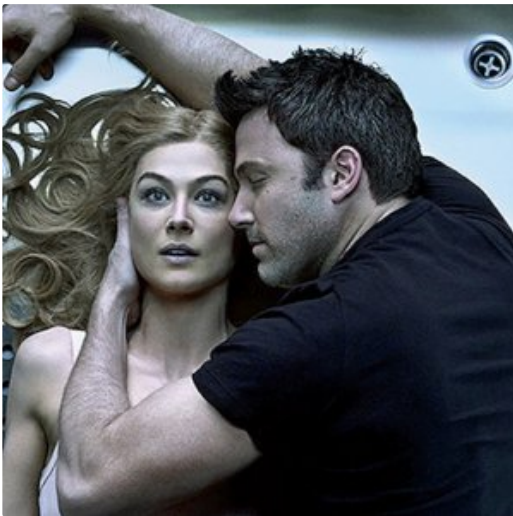
Love Scenes That Went Too Far