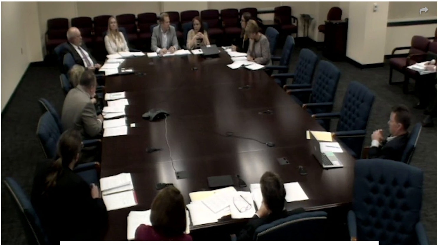
Public Service Com