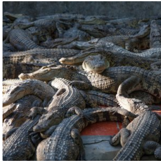
2-Year-Old Girl Eaten Alive by Crocodiles After Falling Into Pit