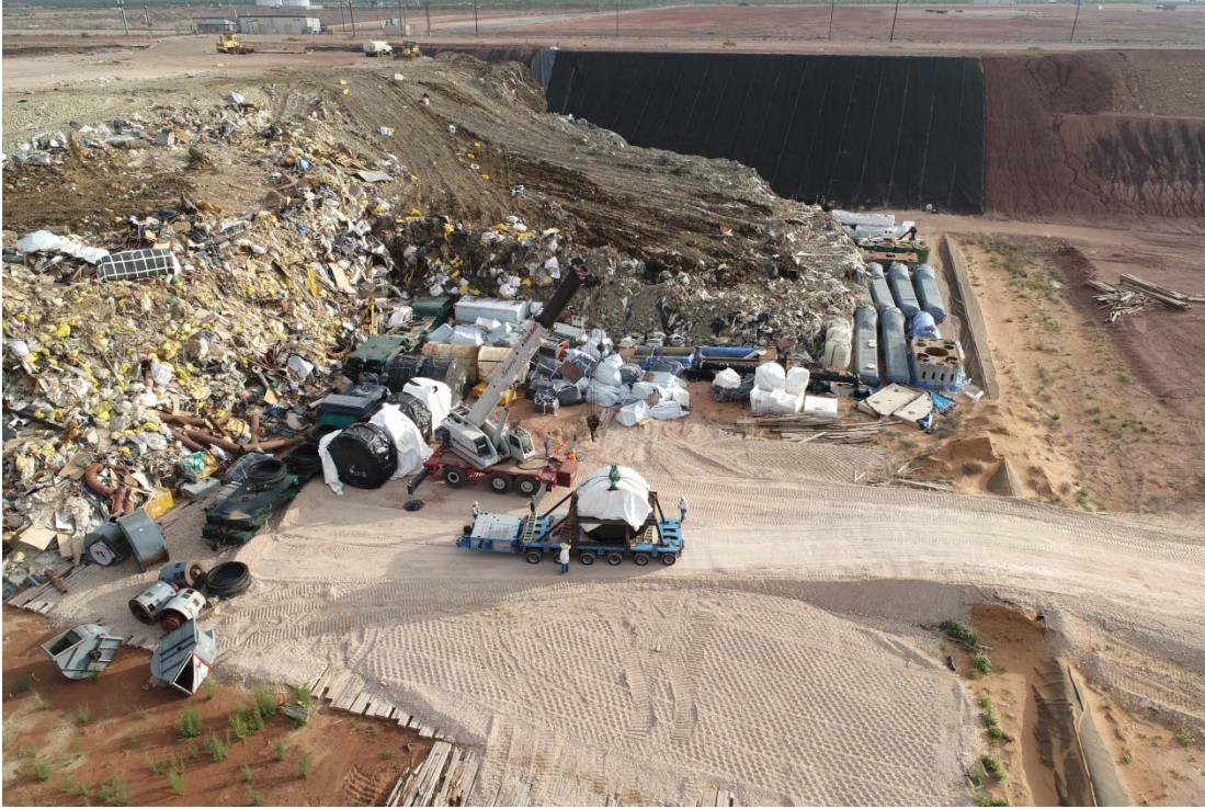
Building Demolition AC Diesel Generator Building