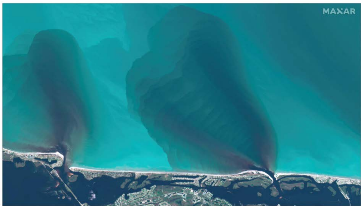
A view shows sediment discharging to sea after Hurricane Ian hits Don Pedro Island, in Florida, U.S. September 30, 2022.

If the county is focused on local water quality, Charlotte County Utilities (CCU) would follow the lead of neighboring Sarasota, Manatee and Lee counties and prioritize work with Charlotte Harbor's National Estuary Program (CHNEP) to upgrade wastewater treatment to Advanced Wastewater Treatment (AWT) standards reducing excess nutrient in reclaimed wastewater – again which all flow into Lemon Bay. In the wake of Hurricane Ian, several wastewater treatment plants around the state dumped raw sewage into Florida Waterways. From the October 2, 2022 Bloomberg article highlighting the service area, note the sewage is flowing through the passes into the gulf and NOT from the individual island septic tanks.