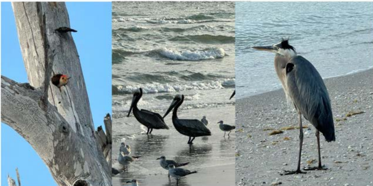
The island wildlife is flourishing!

Our small unique 7 mile bridge-less barrier island is home to a diverse array of wildlife-native & migratory birds, endangered species such as our gopher tortoises, wild honey bees, bobcats, bats, owls, ospreys, American bald eagles, seasonal endangered sea turtles & our abundance of fish and marine life, such as manatees. The Island is within the boundaries of the Lemon Bay Aquatic preserve which provides important estuaries, seagrass & oyster beds that filter the waters.