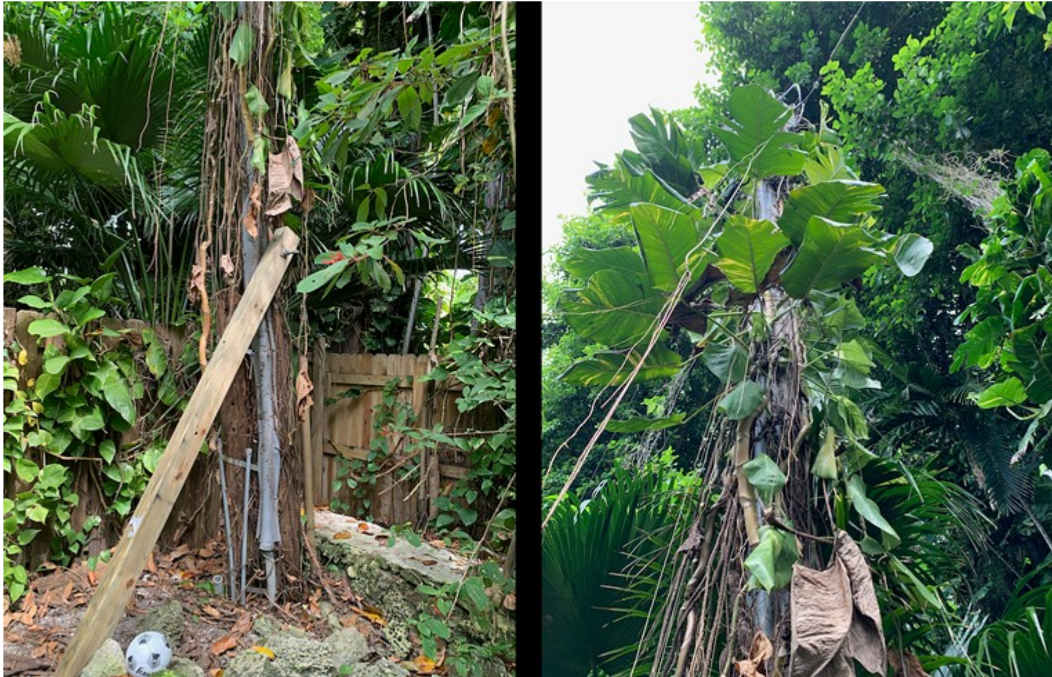
After the storm: FPL finally sent out a crew to shore up the old pole temporarily.

It turned out the leaning utility pole had finally fallen, severing a powerline that singed one of his neighbor's trees.