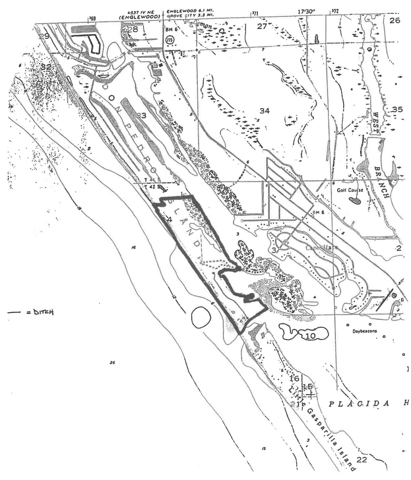
THZS RZOE 53,4,10