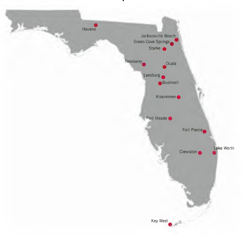
Figure 1-1 ARP Participant Cities

Following is a brief description of each of the ARP Participants who is provided capacity and energy from the ARP.