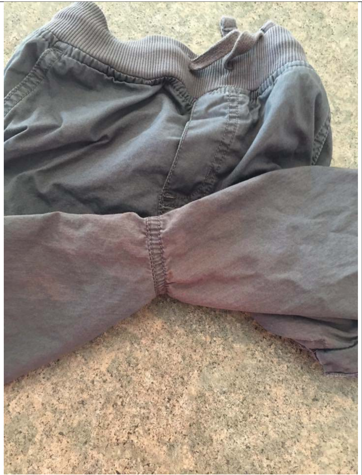
Photo 8 - Bleached clothing after FDEP approval of Chlorine Dioxide (CLO2) use in Pluris water.