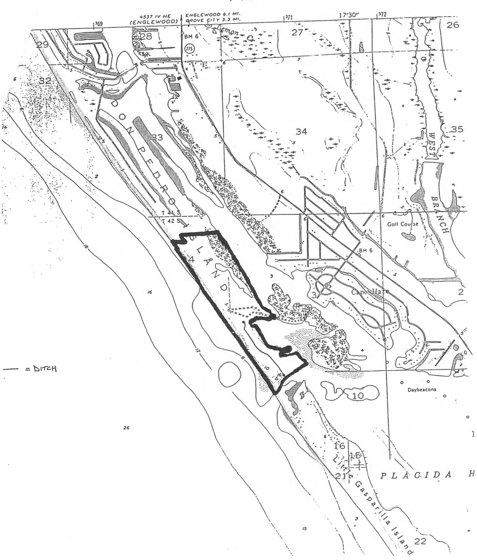
T4ZS RZOE 53,4,10