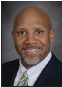
COMMISSIONER Art Graham