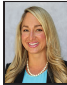
COMMISSIONER Gabriella Passidomo