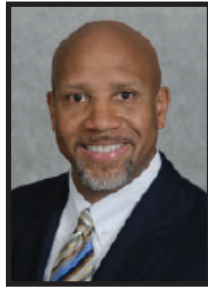
COMMISSIONER Art Graham