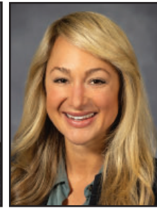
COMMISSIONER Gabriella Passidomo