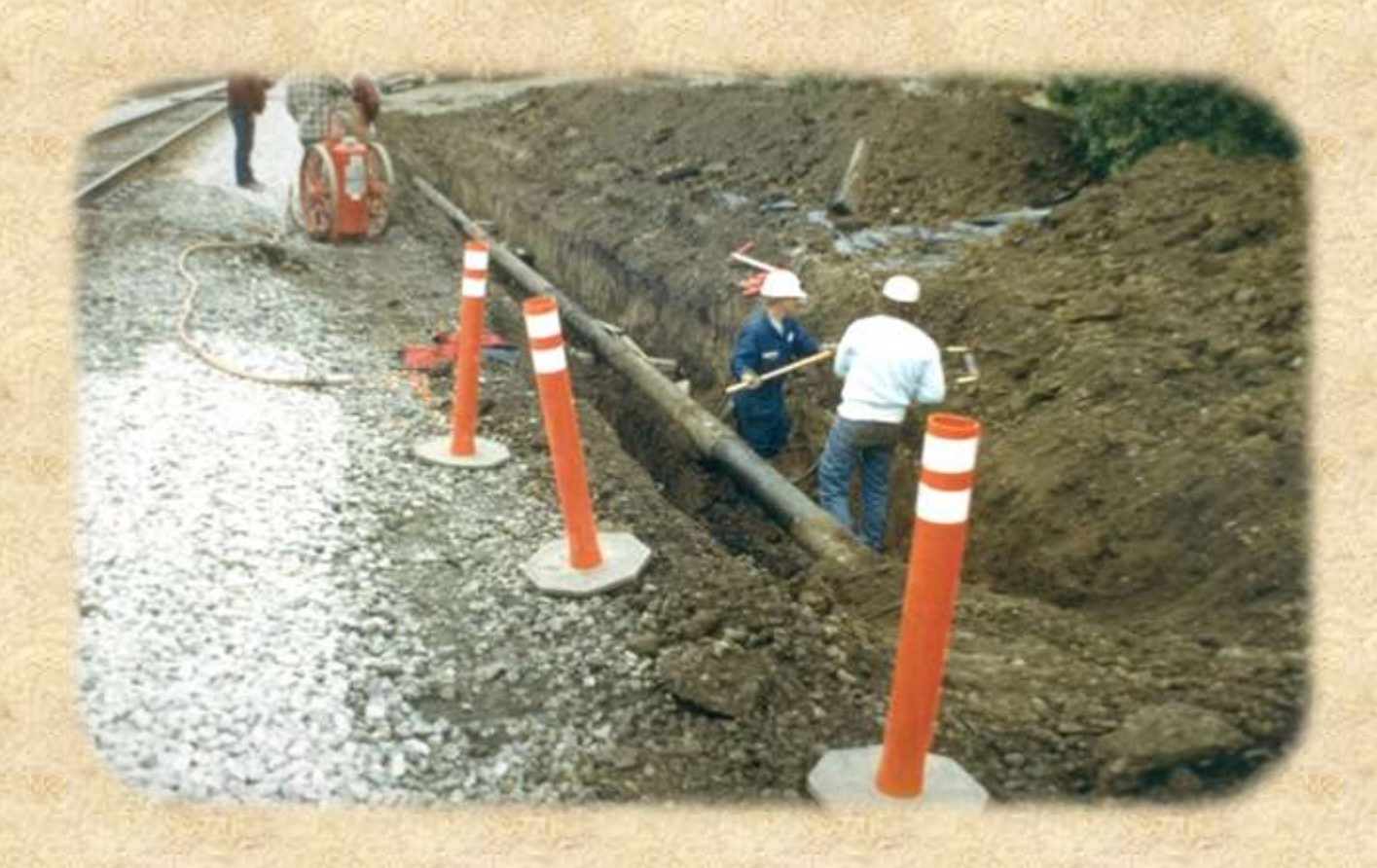
Part 192 Subpart "M"