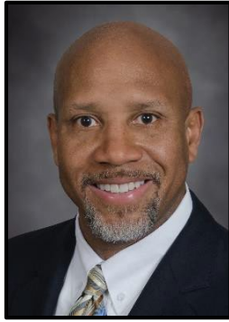
COMMISSIONER Art Graham