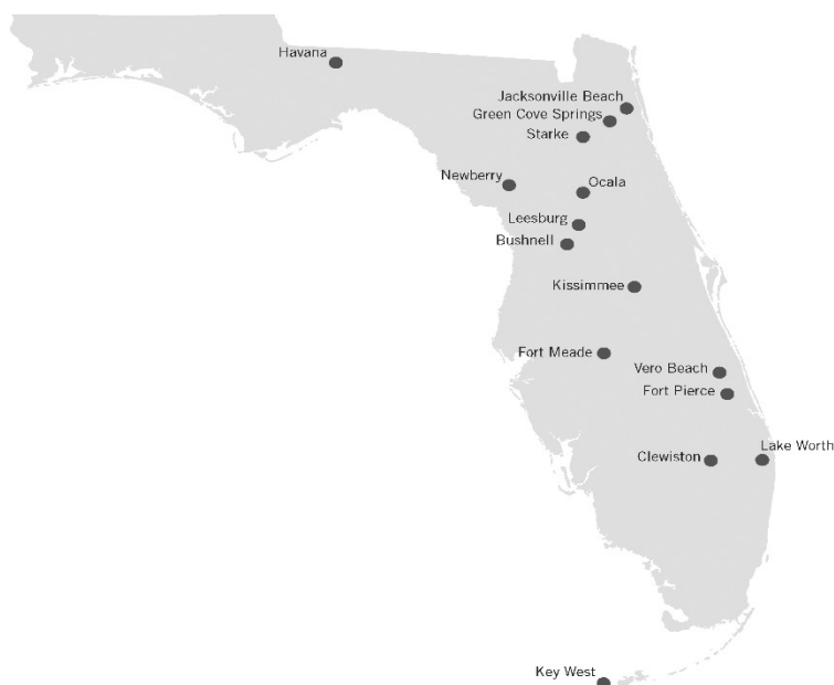
Figure 1-1 ARP Participant Cities

Following is a brief description of each of the ARP Participants who is provided capacity and energy from the ARP.